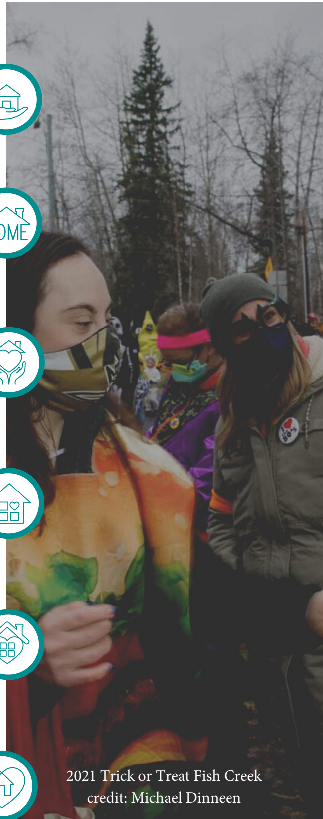
2021 Trick or Treat Fish Creek